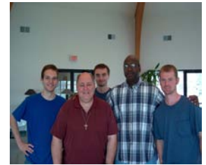
YAC 2004 (Bethany Beach, DE)